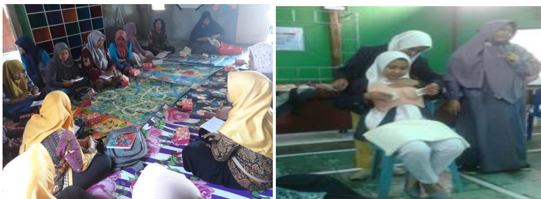
Figure 4. Breastfeeding Skills Training

This community service activity is then continued with skills training for breastfeeding mothers, which includes proper breastfeeding methods, how to massage oxytocin, how to express breast milk properly, and how to store breast milk properly. This method is commonly used to improve the skills of trainees, as was the case in a study on lactation management training activities for pregnant and lactating women in Sokaraja, where this activity was carried out using demonstration methods by presenters or resource persons and continued with demonstrations by training participants. Through the demonstration method of what has been demonstrated, the service team then demonstrates or practices the correct breastfeeding technique. In this method, the community service team brings media in the form of dolls (mannequins) to practice good breastfeeding techniques. The findings of this study have been shown to significantly improve trainee knowledge [11].