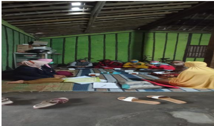
Figure 7. Activity Monitoring and Evaluation

The conclusion of this series of community service activities is monitoring and evaluation. This activity was carried out by observing the activities carried out directly during the assistance, followed by an evaluation of the program of activities with village cadres and midwives. The results obtained in the form of all planned service programs have been implemented as a whole with generally good results.