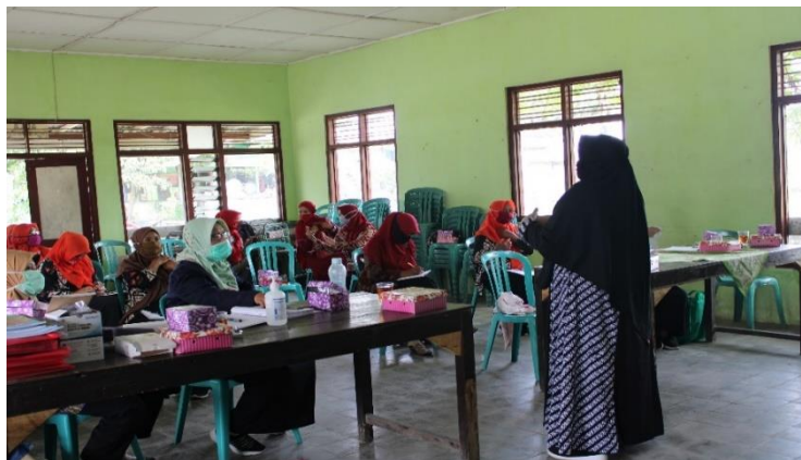
Figure 2. Health Education

Counseling for breastfeeding mothers was carried out during posyandu activities held in one of the RWs' homes in Menayu Hamlet. This activity was attended by 20 breastfeeding mothers, 5 cadres, 1 village midwife, and a community service team from UNIMMA. Counseling activities began by conducting a pretest on participants with a written test that provided a total of 20 multiple-choice questions. Then proceed with health education about the importance of exclusive breastfeeding, the problems that occur during breastfeeding, and how to overcome these lactation problems. Then a posttest was carried out to find out the extent to which knowledge was achieved from the health education provided.