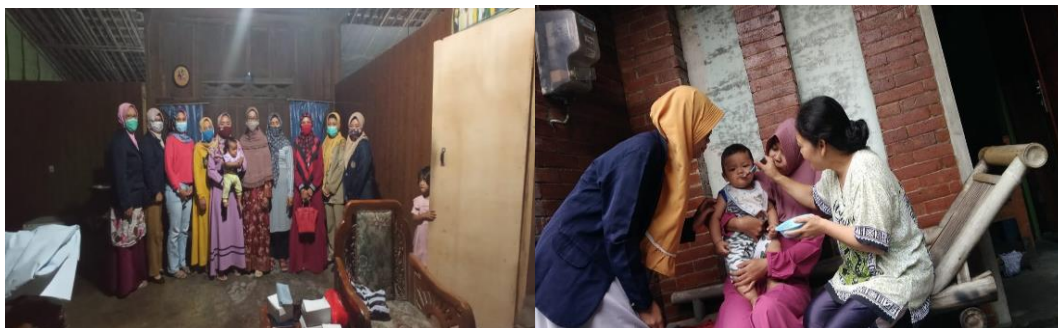
Figure 6. Mentoring Activities

After conducting skills training related to lactation management, assistance is then carried out by the community service team. This assistance is carried out at posyandu activities and during visits to nursing mothers' homes. Assistance is carried out by the service team and health cadres who have received lactation counseling training. The results of this mentoring activity were carried out through observing breastfeeding mothers practicing breastfeeding and oxytocin massage, with the result that it was concluded that 5 breastfeeding mothers from 4 observed hamlets could carry out lactation management practices well.