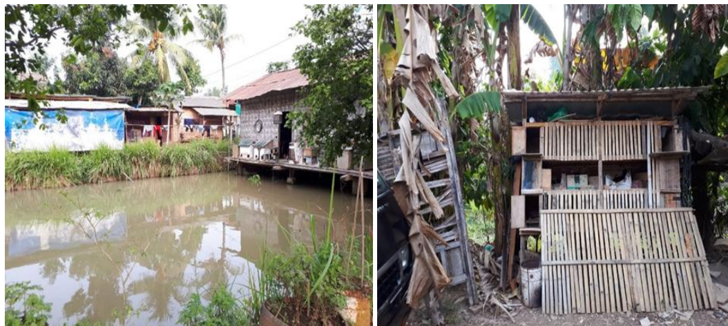
Figure 9. Fish, poultry and goats farming of the Bernung Village community

The technical results obtained from the geoelectrical survey were subsequently integrated into community empowerment activities. In the fisheries, livestock, and plantation sectors, the community successfully improved and developed fish ponds and plantation areas that had previously been underutilized. The results of livestock-development and plantation-supporting activities are shown in Figures 9 and 10. These developments demonstrate that groundwater identification and water-resource planning provided not only technical information but also practical guidance for strengthening local economic activities. During the final evaluation stage, the community service team revisited the site to assess plantation activities, fish farming, and groundwater utilization. Moreover, the program contributed to the diversification of local livelihoods and encouraged more sustainable resource management practices.