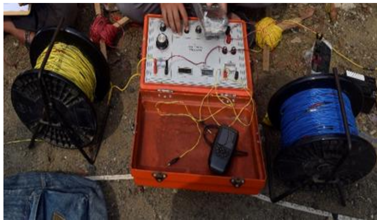
Figure 2. Full set of 1D resistivity method measurement tools

The main instruments used for groundwater identification were a one-dimensional (1D) Vertical Electrical Sounding (VES) geoelectrical survey employing a Schlumberger configuration (Antosia et al., 2022). Data acquisition was carried out using a Naniura resistivity meter at two observation locations, namely Point 1 (T-01) and Point 2 (T-02), on 6 July 2025. Documentation of the geoelectrical instrument and field measurement process is presented in Figure 4. The Schlumberger configuration was selected because of its capability to identify vertical variations in subsurface resistivity and delineate potential aquifer-bearing layers. The measurements were conducted by progressively expanding the electrode spacing, with AB/2 distances ranging from 1.5 to 150 m and MN/2 distances ranging from 0.5 to 10 m, allowing deeper subsurface penetration and improved resolution of vertical lithological variations. Apparent resistivity values were obtained from field measurements of injected electrical current and potential differences using the Schlumberger geometric factor. The acquired geoelectrical data were subsequently processed and inverted using IPI2Win software to obtain true resistivity models and subsurface layer geometry (Tso et al., 2021; Rahmaniah et al., 2021).