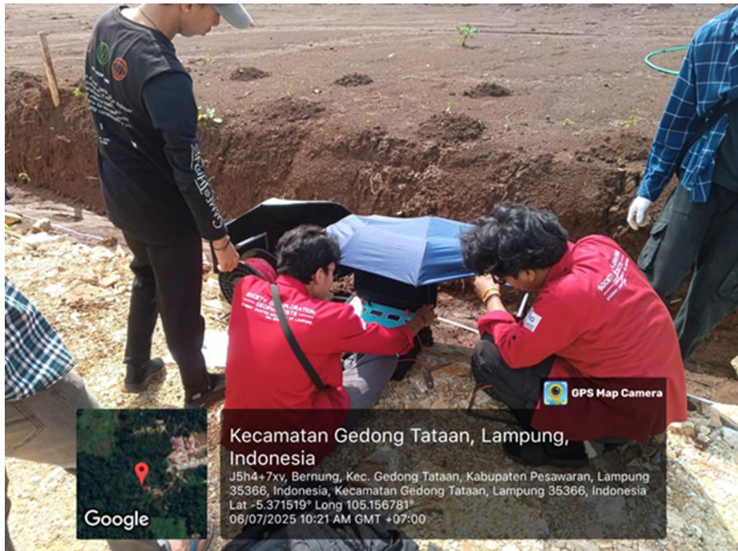
Figure 7. Resistivity measurement documentation Point 2