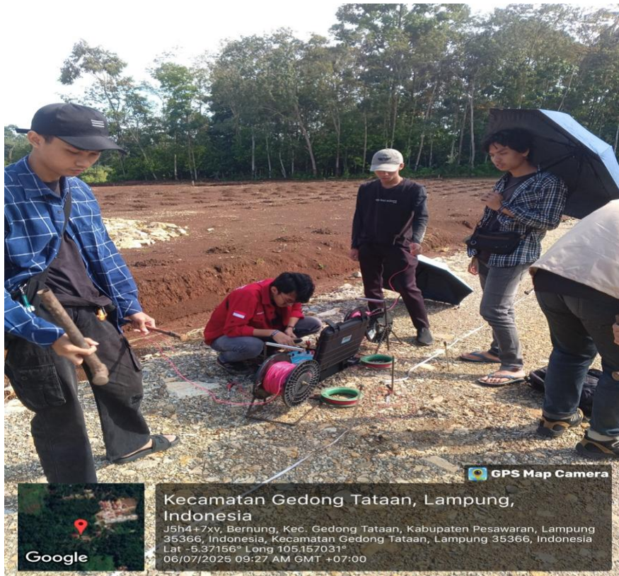
Figure 5. resistivity measurement documentation Point 1