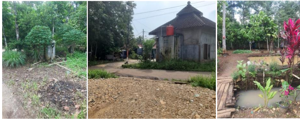
Figure 3. Evaluation of highland water control to reservoirs in Gedong Tataan Village

possessed land resources with considerable potential for plantation and fish-farming development, although these resources had not yet been optimally managed. The inspection of land suitable for plantation and fish-farming development is presented in Figure 4, while the condition of the fish ponds that served as supporting infrastructure for community-based businesses is shown in Figure 3. These observations indicate that the principal limitation faced by the community was not merely land availability but rather inadequate water accessibility and limited technical capacity for water-resource management.