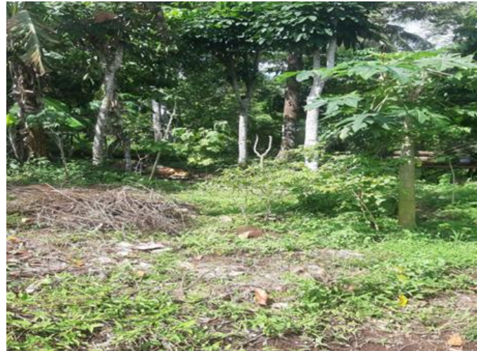
Figure 10. Plantation of the Bernung Village community

From an economic perspective, the program contributed to the diversification of community livelihoods and business activities. Prior to the implementation of the community service program, partners' income mainly depended on plantation products, resulting in relatively limited and less diversified sources of revenue. Following the program, additional productive activities developed through vegetable cultivation, fruit production, and fish farming, as presented in Tables 2 and 3. Although the economic outcomes require longer observation to demonstrate long-term impacts comprehensively, the emergence of multiple income-generating activities indicates that improved water accessibility and technical assistance supported broader community business development (Zahra et al., 2021). Therefore, the economic benefit of the program should be understood not only in terms of monetary income but also through enhanced livelihood diversification, improved resource utilization, and strengthened local productive capacity.