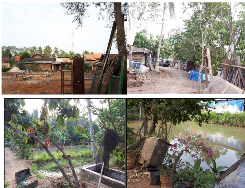
Figure 1. Condition of the Community Service Location

In the initial stage, the community service team conducted a field survey together with community partners to identify the condition of mountain water sources, storage tanks, water distribution pathways, fishpond locations, and land with potential for plantation development. This preliminary survey also aimed to recognize environmental and technical constraints associated with water accessibility and agricultural activities. The preliminary survey activity is shown in Figure 1. The findings from this survey served as the basis for formulating more effective water utilization strategy in accordance with the needs and conditions of the community partners.