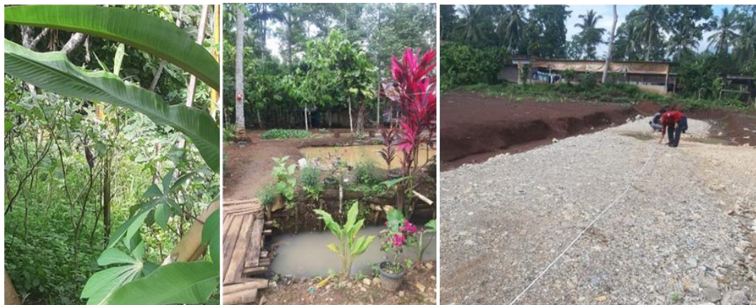
Figure 4. Evaluation of land that can be made for plantations and fish farms

From the technical perspective, the core activity of the community service program was groundwater identification using the geoelectric method. Measurements were carried out using the Schlumberger configuration at two points, namely Point 1 (T-01) at UTM coordinates X: 517394 and Y: 9406261 in Zone 48S, and Point 2 (T-02) at UTM coordinates X: 517369 and Y: 9406266 in Zone 48S. The geoelectric measurement model for Point 1 is presented in Figure 5, while the geoelectric measurement data for Point 2 are presented in Figure 7.