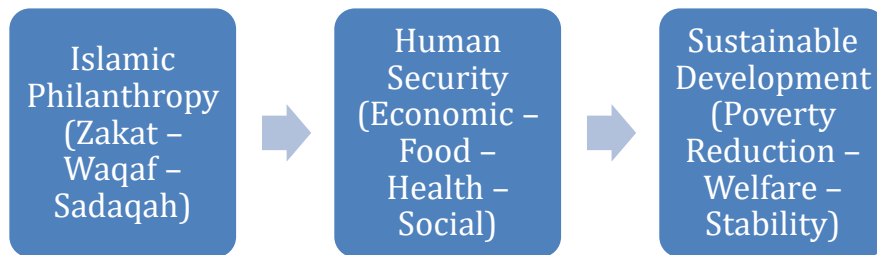
Figure 1. Conceptual Framework Model