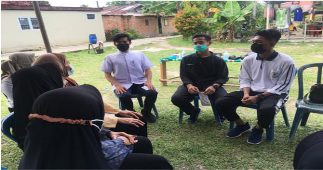
Figure 2. Post-stroke interview activity