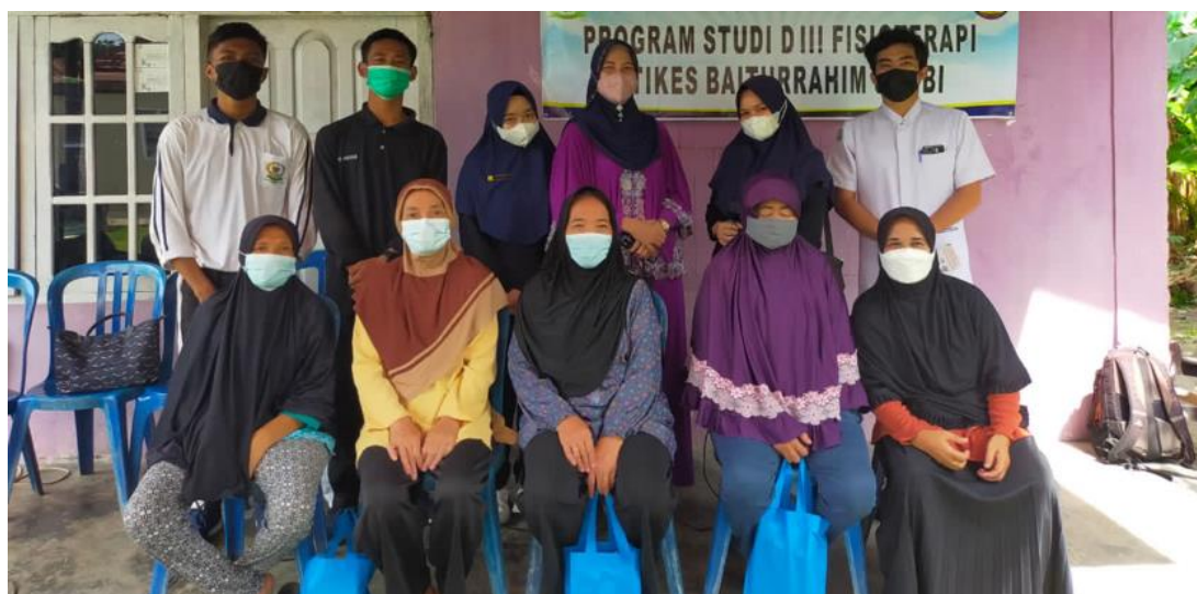
Figure 1. Photo with the Elderly in Kasang Kumpeh Village

Overview of Family Medicine Care for Post-Stroke Patients: The results showed that 49 respondents (83.1%) received good care. In this case, family treatment included medication management, mobilization exercise therapy, speech therapy, and nutritional care for the patient. Here, family support is very important because the family has information that can be used to predict the patient's condition. Stroke patients desperately need family support to survive, as the family is their psychological treatment. This support is very important to create peace and comfort and to show their existence as individuals living together in the family.