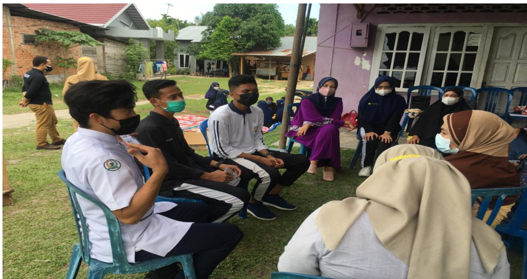
Figure 3. Discussion with the Elderly