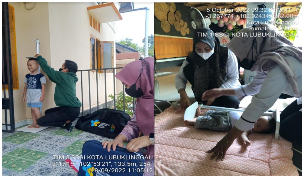
Figure 1. Anthropometric Measurements by SSGI Enumerators

The Indonesian Nutritional Status Survey is a national-scale health survey conducted by the Indonesian Ministry of Health in all regions of Indonesia. This survey aims to describe the nutritional status of children aged 0-59 months (stunting, wasting, underweight, overweight) using the indicators BB/TB, BB/E, PB/A and TB/A. Enumerators used a questionnaire tool to obtain data by interviewing participants, utilizing observational techniques, and measuring the target anthropometrically. The documentation of the data collection tasks completed by enumerators in the field is as follows: