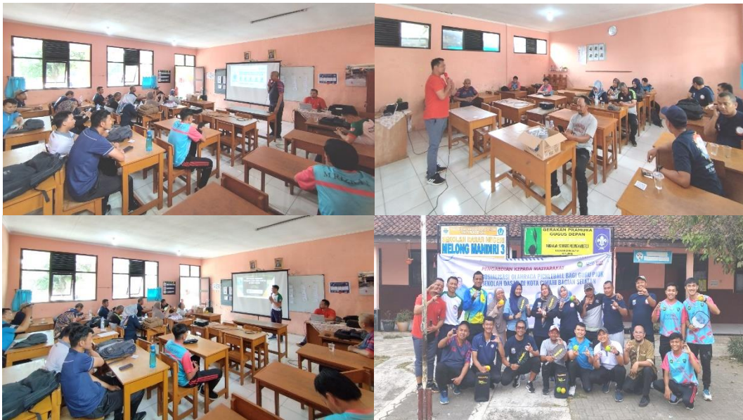
Figure 2. Documentation of Activity Implementation

Based on the results of this service activity, it shows that what was proposed in the problem formulation can be implemented well. From the results of the implementation of this activity, it was found that the interest of PJOK SD teachers in the South Cimahi area, Cimahi City to find out additional knowledge of technical training and pickleball game rules was very high, even though in previous activities they had not understood and mastered the basic technical material and pickleball rules. This very valuable opportunity is not wasted even though it is realized that the facilities and equipment for this activity are very limited. But with strong enthusiasm and encouragement from coaches, lecturers and sports teachers, this activity becomes a useful activity.